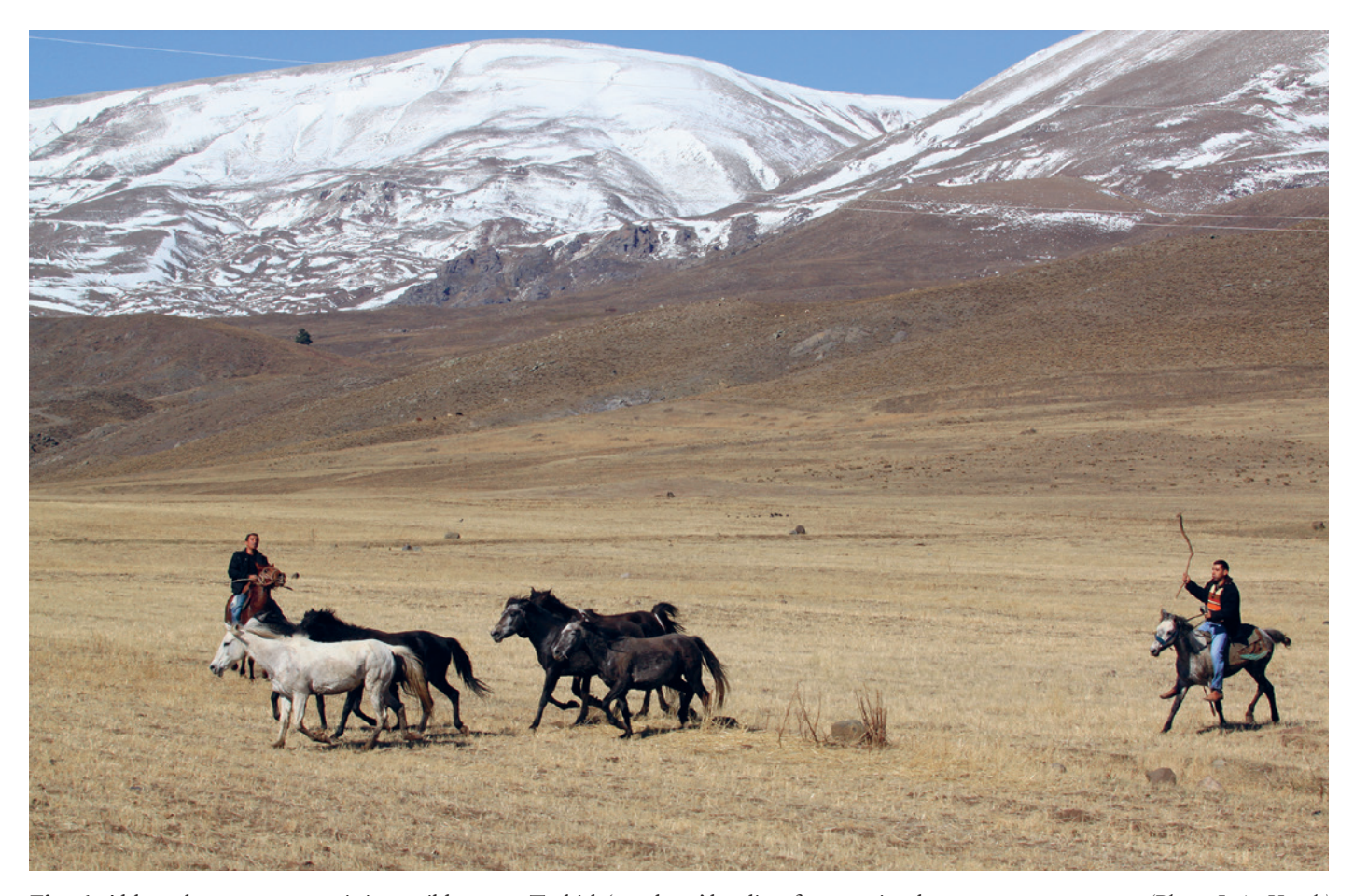
Fig. 6 Although not common, it is possible to see Turkish 'cowboys' herding free-grazing horses.

Cattle herds and sheep flocks usually consist of several hundred animals (Fig. 9). They are taken to summer villages and camps after the snow melts. There, they graze on mountain slopes as far and as