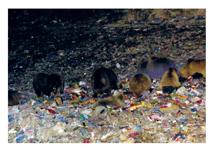
Fig. 5 Ten bears feeding in Sarıkamış garbage dump in 2011.

Sarıkamış town garbage dump is open, smoky, smelly and generally unpleasant, but is a rather important habitat component for some bears. It is situated one kilometre west of the town, next to the main road and 200 metres from the edge of the forest. In summer, we observed up to 20 bears feeding at the dump (Fig. 5), as well as some wild boars ( Sus scrofa ) and even wolves. Numerous stray dogs live at the