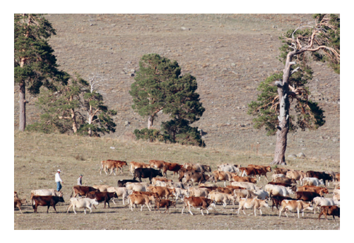
Fig. 8 A cattle herd crossing overgrazed pasture while returning to the village for the night.