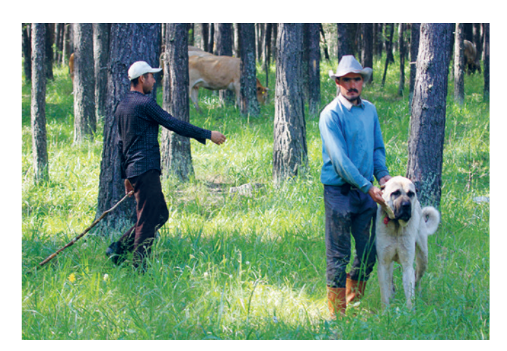
Fig. 17 The Anatolian Mastiff was seldom used as a guarding dog, but more often as a pet.

Determining the actual extent of losses to predators would be tricky since there is no damage compensation system. In my home country of Croatia,