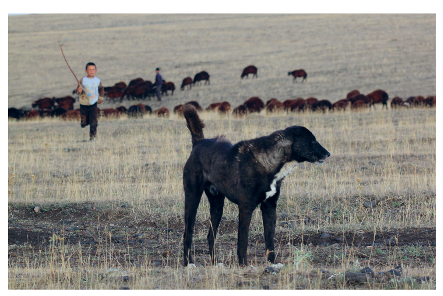
Fig. 9 Sheep flock accompanied by shepherds and a Karaman dog.

Domestic animals which die on pastures or in stables are left on pastures or in the forest. Carcasses left on open pastures are usually eaten by scavenging birds, those left in or close to forest are eaten by bears or wolves (Fig. 10), while there are many village dogs