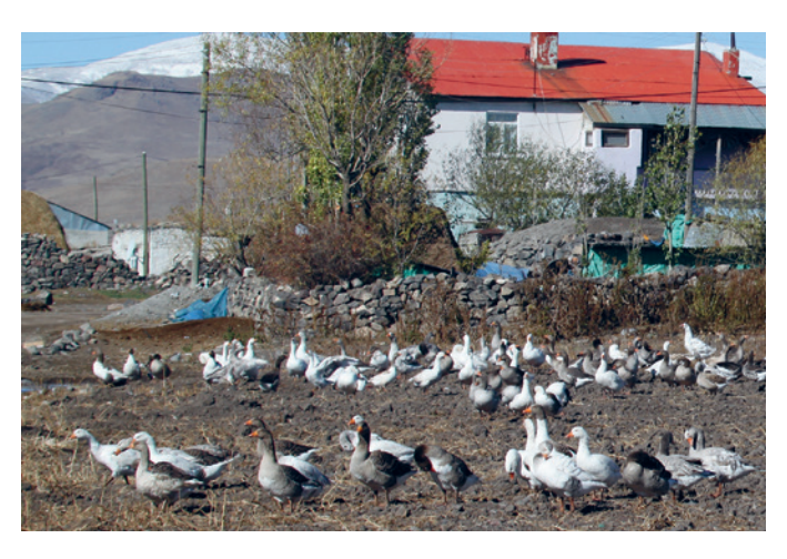
Fig. 7 Geese are the main kind of poultry raised by villagers, with goose meat being one of the well-known delicacies of the area.

Wild ungulate grazers have been almost completely replaced by domestic animals. In a decade of camera trapping, we documented the occurrence of roe deer ( Capreolus capreolus ) on only four occasions! In Kars province alone, about 850,000 heads of livestock are registered: mostly cattle, sheep, some horses, and donkeys. The total number of dogs, including sheep dogs as well as strays in villages, towns, and garbage dumps, may be 30,000 to 40,000. Donkeys and horses are used as work animals. Most of the time they are