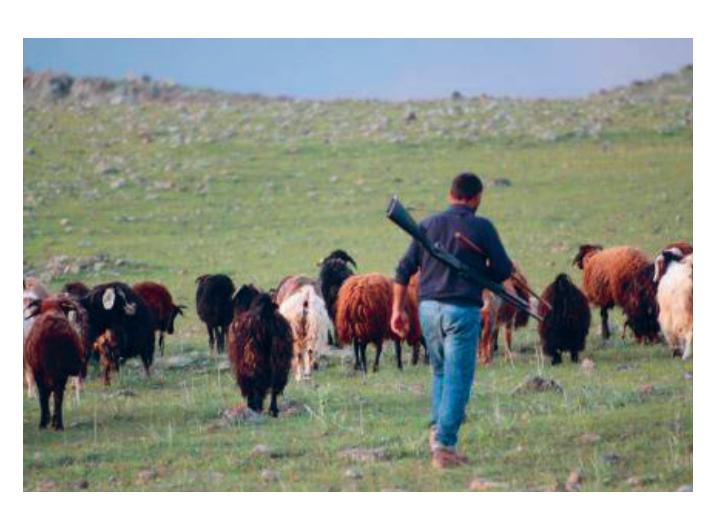
Fig. 12 Armed shepherds guarding sheep in 2013.

Livestock guarding dogs (LGDs) are present on pastures and when livestock is gathered in pens at night. They are used for guarding sheep and cattle which graze near or inside forests (Figs. 13 and 14). Some cattle herds grazing at least a kilometre away