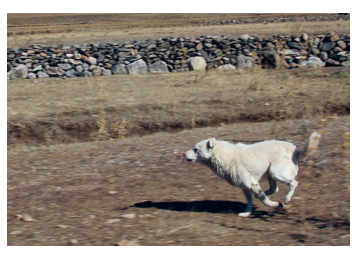
Fig. 15 The Akbash is rarely seen in the Sarıkamış area.

known and common breeds, while the others are in decline in Turkey (Yilmaz et al., 2015).