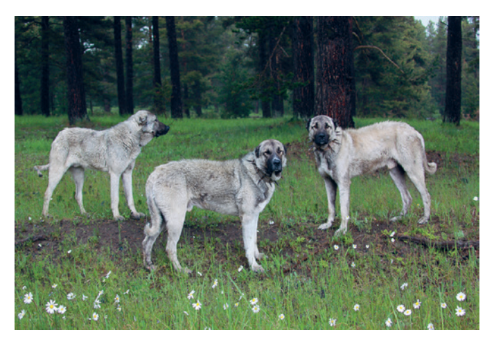
Fig. 14 The Kangal Shepherd Dog is the most common breed of LGD used in the Kars-Ardahan area.

from forest can be seen accompanied by shepherds without LGDs, but sheep flocks are always accompanied by both dogs and shepherds. LGDs accompany livestock day and night together with one or more shepherds who control them. Herding dogs were not used.