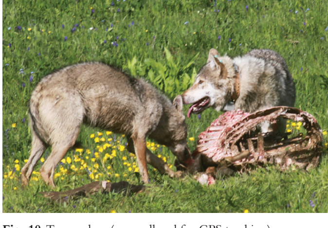
Fig. 10 Two wolves (one collared for GPS tracking) feeding on a cow carcass which was dumped at the roadside by villagers.

high as they can reach during the day and are always gathered in guarded pens overnight (Fig. 8). Livestock is also allowed to graze in forest patches, including forests inside the Sarıkamış-Allahuekber Mountains National Park (front cover). All snow melts by mid-July and streams at higher elevations dry out. If water has not been secured by owners, livestock must move to lower elevations at this time. Remaining grass is