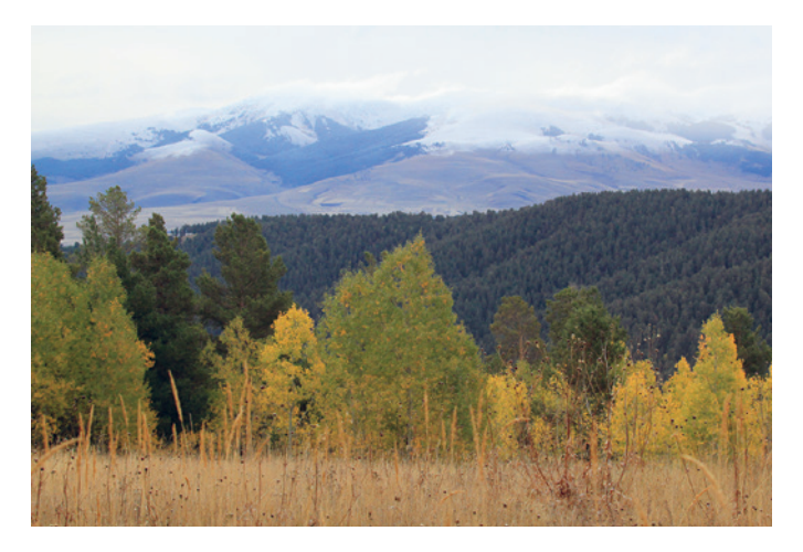
Fig. 4 Beside Scots pine, small stands of Eurasian aspen ( Populus tremula ) grow at lower elevations and on south-facing slopes.

We have analysed habitat types, topography, prey base, human presence and activity. We have not yet determined the density of wolves and bears, but my impression is that it is similar to that in good habitats with high abundance of wild ungulates, even though wild boars were the only species of wild ungulate prey available to wolves. From diet analysis, we learned that wolves eat mostly domestic animals during grazing periods (Capitani et al., 2016), but the ratio between predation and scavenging is still unknown. Livestock is kept in stables during the winter when the diet of wolves includes village dogs. The effect of livestock husbandry and seasonal changes on the ecology of wolves in the area have not yet been studied.