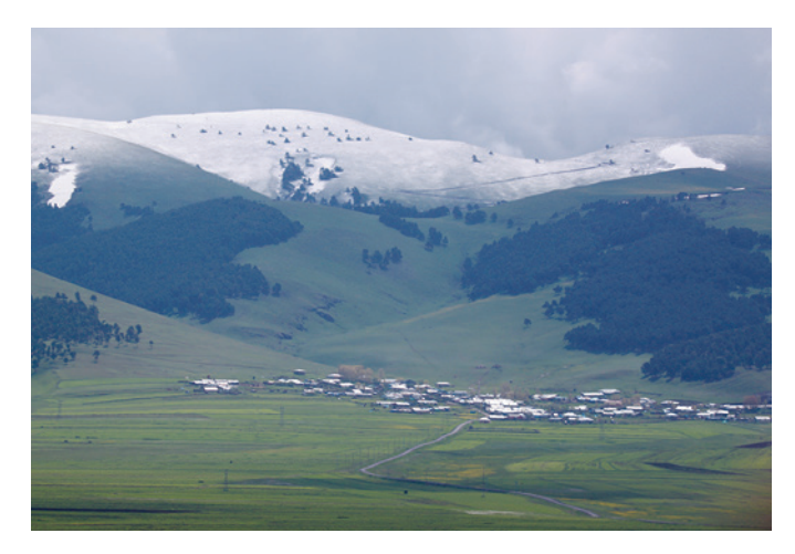
Fig. 2 Hamamli, one of many villages on the Kars-Ardahan plateau. Late spring snow is not unusual at altitudes of 2,000–3,000 m.

many cows and sheep. Only some higher hills were covered with small, dark forest patches. Scattered villages, or rather groups of houses built apparently without much planning and with strange contrasting blue tin roofs, were connected by dirt roads to the two main roads running through the valley (Fig. 2).