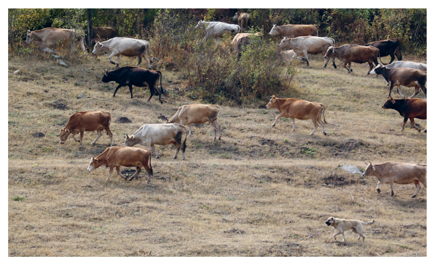
Fig. 18 Livestock guarding dogs are commonly used to guard cattle, with shepherds always accompanying herds.