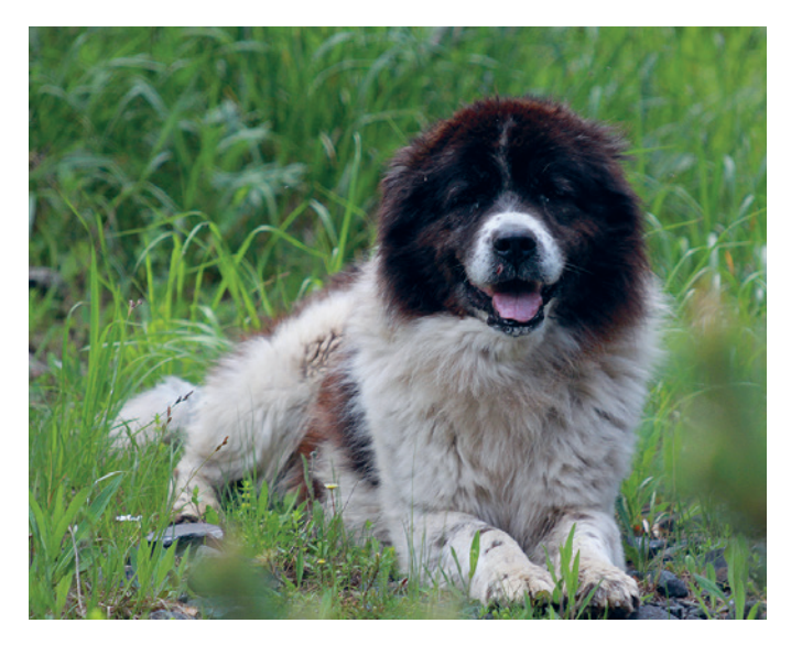
Fig. 19 Long-haired Kars (Caucasian) Shepherd Dog and Koyun were sometimes seen guarding sheep flocks.

We did not hear about any problems with LGDs or dogs in general. Sarıkamış is full of stray dogs which