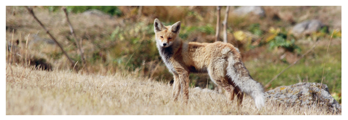
Fig. 11 Red foxes are commonly seen on open pastures, but rarely observed or documented by our automatic cameras in forests around Sarıkamış area.

which feed on the carcasses left close to human habitation. This is illustrative of local people's views of and relationship to nature. Wolves and bears have always been present in the area. If they eat a cow which died, then they will not have to attack and kill another one. At the same time, for the owner, the problem of how to dispose of the carcass is solved.