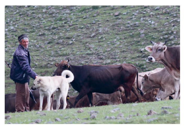
Fig. 13 Livestock guarding dogs and shepherds accompanying a cattle herd.