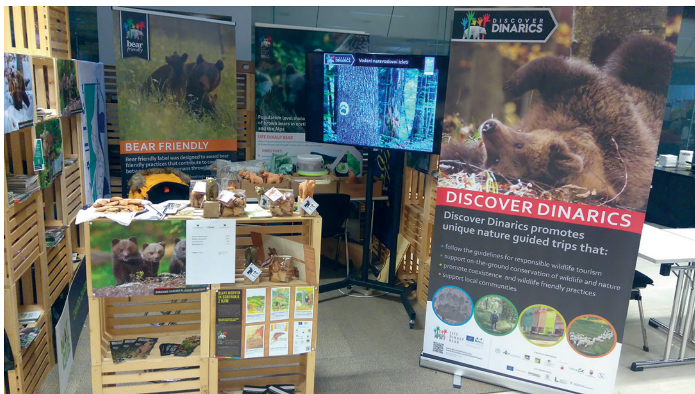
Fig. 9 Stand promoting bear friendly offers and the Discover Dinarics portal at a tourism fair.

To promote bear friendly ambassadors and bring attention to responsible bear tourism practices, we have created the Discover Dinarics web portal ( www.discoverdinarics.org ), which has been online since March 2017. Within the portal, there is a map displaying an inventory of bear friendly products, enabling users to quickly find a bear friendly offer in their proximity. The portal enables direct inquiries for best practice bear friendly tourism programmes offered by different tour operators who are willing to donate part of their revenues for large carnivore coexistence.