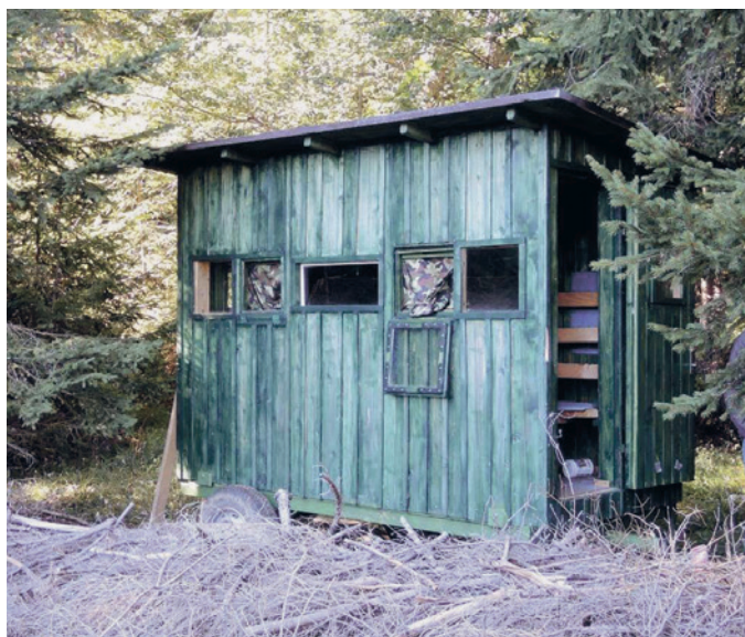
Fig. 3 Tourists in bear watching hides should be under the constant supervision of a qualified guide.

The document also gives basic recommendations on the development of bear-related tourism programmes, which should not be based solely on bear observations, but should include learning about human-wildlife coexistence heritage within local communities in the region. In addition to these guidelines, we propose that a portion of revenues from bear-related tourism activities be invested directly in activities promoting conservation of the species or improvement of human-bear coexistence.