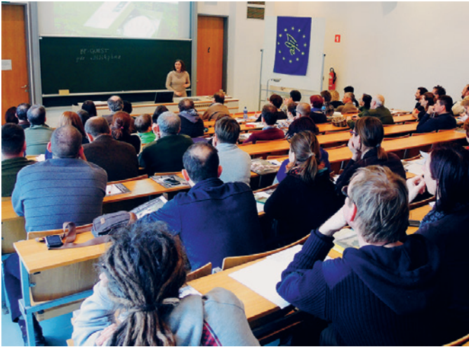
Fig. 10 Educational seminars for tourist guides and hunters interested in bear-related tourism, held at the Biotechnical Faculty, University of Ljubljana, in January 2016.