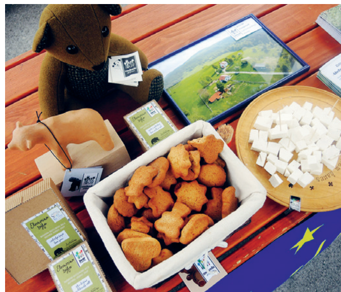
Fig. 5 The bear friendly label can be applied to a wide variety of local products that contribute to human-bear coexistence.