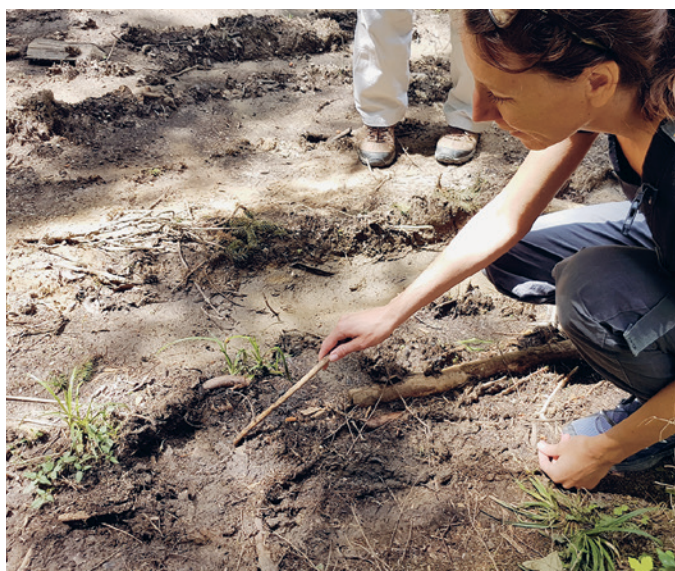
Fig. 8 Bear tourism programmes should include experiencing the bear habitat, recognizing signs of their presence and learning about human-bear coexistence.