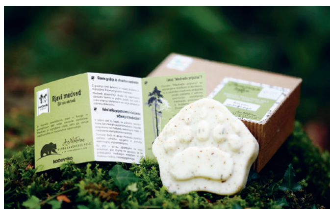
Fig. 7 A leaflet included with bear friendly handmade soap communicates key bear conservation issues.

Local products such as natural soaps (Fig. 7), clay ceramics, magnets, wooden souvenirs and many other handcrafted souvenirs in large carnivore areas already feature a bear motif, indicating their important value to people and culture. Besides having a bear motif, souvenirs labelled as bear friendly need to provide other relevant information about bears, their conservation issues or coexistence measures to raise awareness about these topics among tourists and other buyers. So far, souvenirs from 11 bear friendly ambassadors have been labelled as bear friendly. Such products can enrich the tourism offer in the areas where bear-related tourism is becoming increasingly popular and help to build up the positive image of the bear within the local community working to protect its heritage.