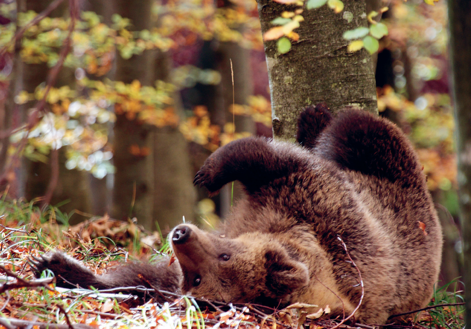
Fig. 2 Bears in the northern Dinarics present new opportunities for local communities.