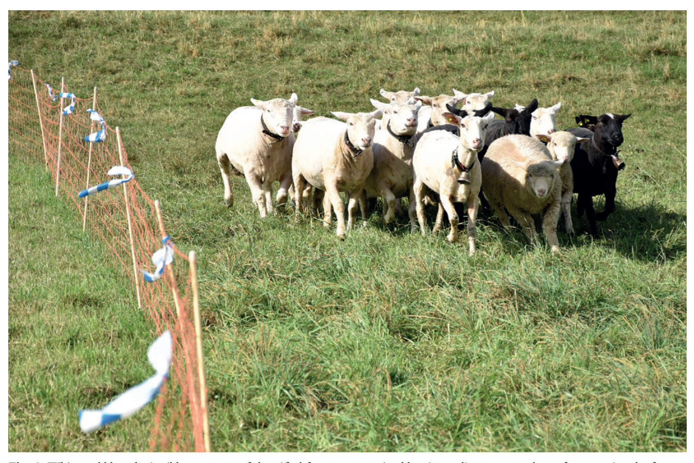
Fig. 4. White and blue plastic ribbons on top of electrified fences act as a visual barrier to discourage predators from crossing the fences.