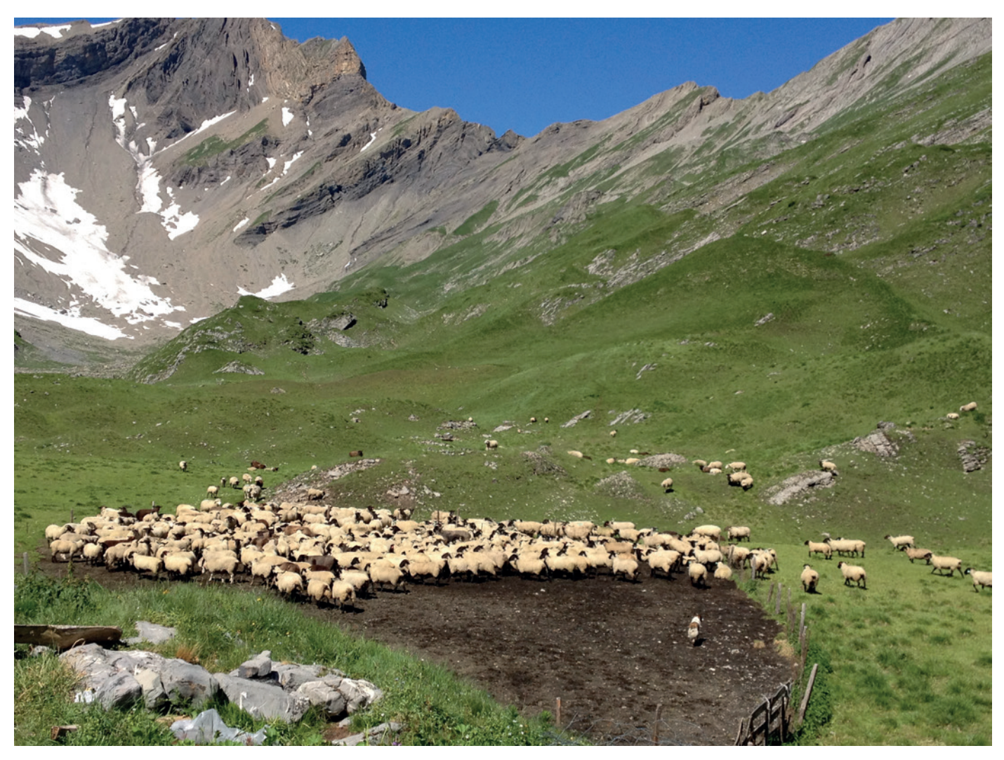
Fig. 6. Night-time pens can be an effective measure to protect livestock in alpine grazing areas, and the FOEN funds the upgrade of traditional net-wire fences to electrified nets.

fences for protection from large predators". There is a ceiling limit per farm of 5,000 CHF for a period of five years.