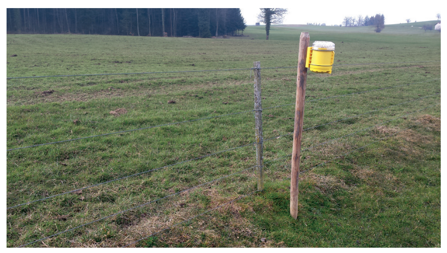
Fig. 8. Foxlights are subsidized to prevent damages during short periods, as part of the emergency kits provided by FOEN to cantons.