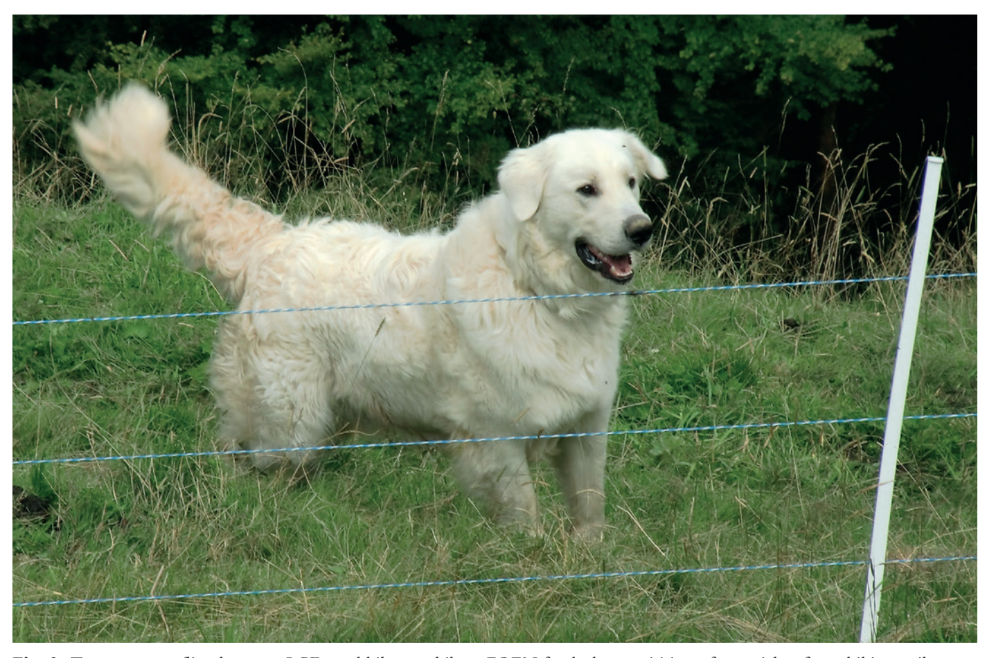
Fig. 2. To prevent conflicts between LGDs and hikers or bikers, FOEN funds the acquisition of material to fence hiking trails.

A further measure aimed at herd protection is the electrical reinforcement of pasture fences, and reinforced fences around stables to keep large predators out (Fig. 3). Measures classified as reinforcement are: 1) an external and low-lying stranded wire (at about 15-20 cm above the ground) and an upper additional wire (at about 105-120 cm, electrified, with non-electrified plastic ribbon as a visual barrier, Fig. 4) to increase the height of the net wire fence; 2) the electrified reinforcement of grazing nets (increased height with one or two additional strands at 110-120 cm)