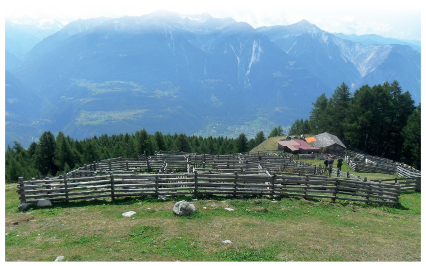
Fig. 3. Reinforcement of traditional fences around stables, adding one low and one upper electrified wire, is funded by the FOEN to increase herd protection.