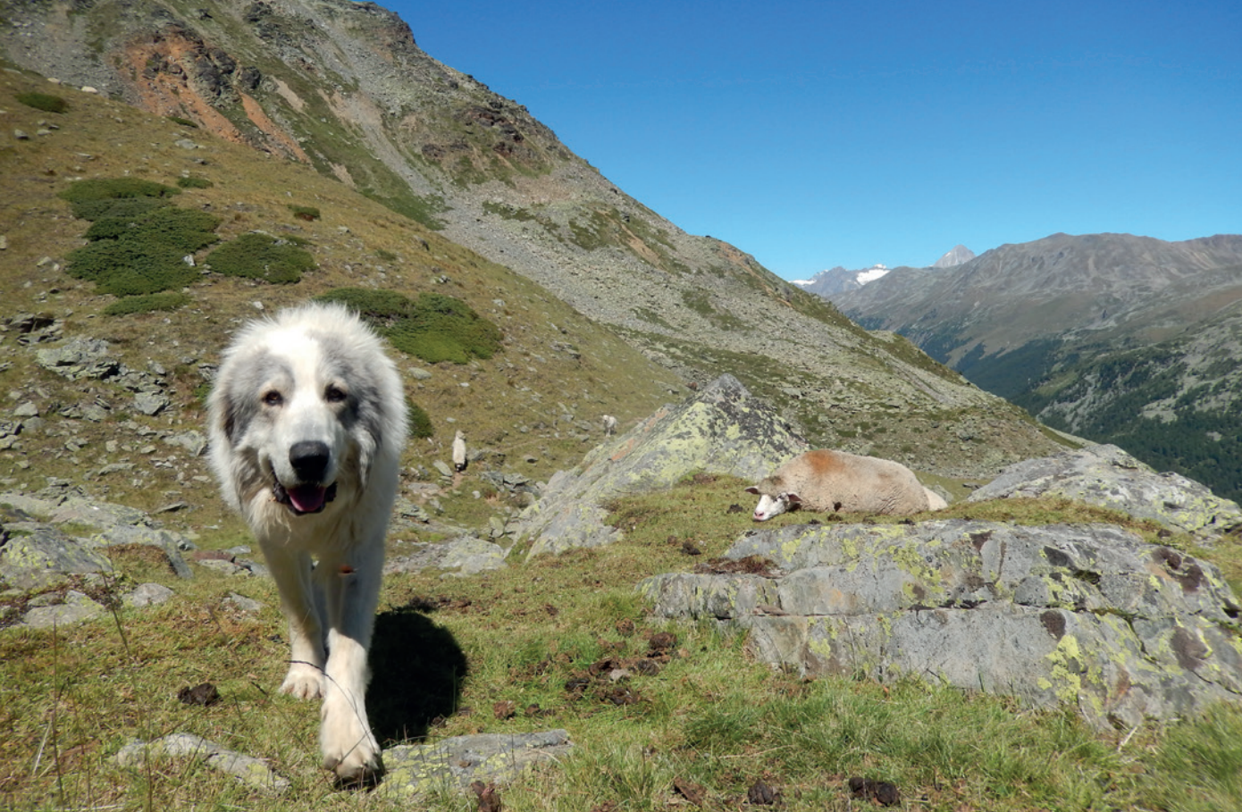
Fig. 1. The Maremma Sheepdog (above) and the Great Pyrenees (below) breeds are supported by the Swiss Federal Office for the Environment under the national herd protection programme.