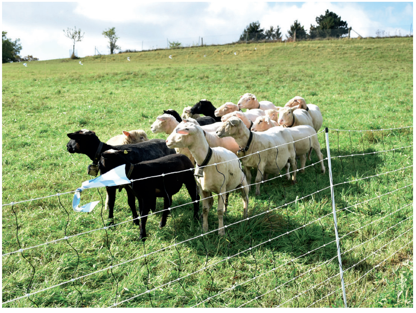
Fig. 5. The reinforcement of electrified grazing nets, by increasing the normal height with one or two additional strands, is also funded by the FOEN.

(Fig. 5). This measure is used in particular in lowland areas, more rarely in mountain pastures. Fencing is recommended in general for relatively small pastures (max. 3-4 ha) where a rotational grazing system is practised.