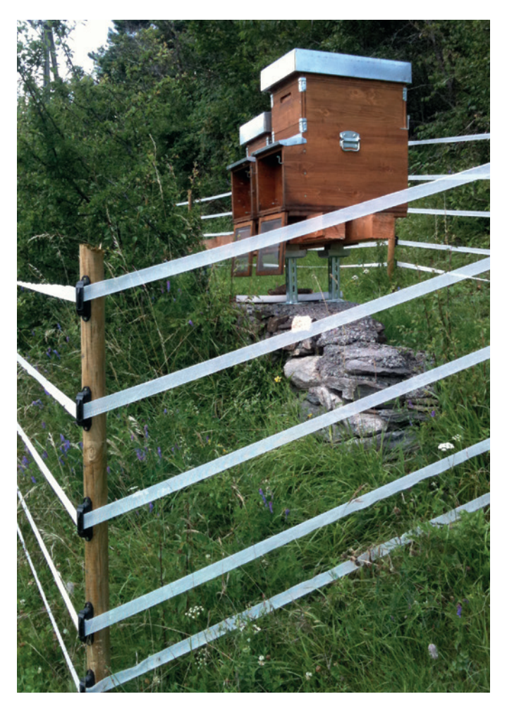
Fig. 7. Beekeepers are also subsidized by the FOEN to install electric fences around beehives to prevent damages from brown bears.

When it is confirmed by an experienced wildlife ranger or by DNA analysis (performed in a certified laboratory) that livestock have been killed by large predators, the Federal Government Confederation and the cantons usually compensate the farmers concerned, irrespective of whether they have taken herd protection measures or not (the compensation amount is currently based on the market and breed reference value of the Swiss breeding associations). This regulation is currently being reconsidered in various cantons to ensure that livestock are compensated only when preventive measures have been taken. On the one hand, this would entail a considerable administrative effort regarding the official clarification of each herd protection measure linked to the damage. On the other hand, this would also increase the incentive for livestock owners to take protective measures. This problem is linked to the fact that the risk of damage by predation is still quite low in some regions. Because of this risk evaluation the farmers may accept some