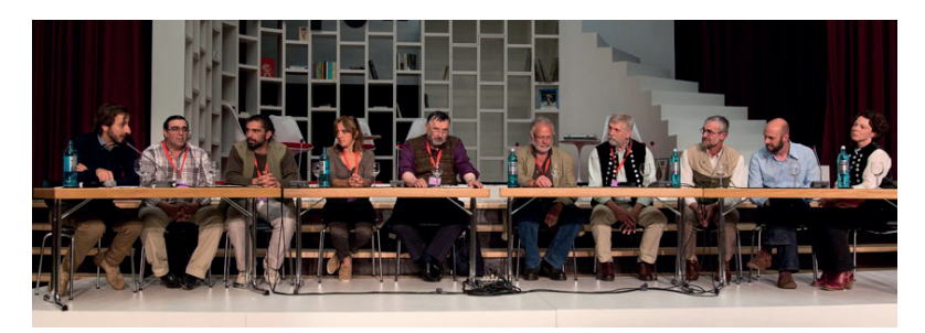
European Shepherds Network Assembly during Documenta, Kassel, Germany 2013.