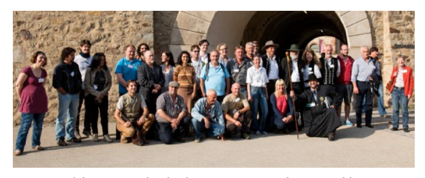
European delegation at the third European Pastoralists Assembly, Koblenz, Germany 2015.

leading institutions. The 2nd ESN Assembly was organised in September 2016 in St. Floir, France. Despite the difficulties and lack of financial resources to have a stable secretariat, the ESN continues to strive to implement the Declaration. We represent the European Section of WAMIP and take part in various international fora as well as creating alliances with other civil society organisations to work on CAP and other issues.