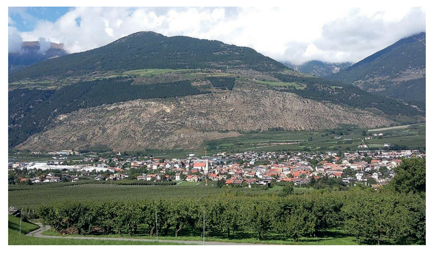
Fig. 5. Productive pastures at low altitudes on the slope between Laas village and the first forest belt, district of Laas, South Tyrol, 2015.

predators on the farm level is not feasible, it may be reasonable to create regional management plans that may include several alpine farms and pastures as well as currently ungrazed areas at lower altitudes, and may also consider reorganisation (including fusion) of alpine farms.