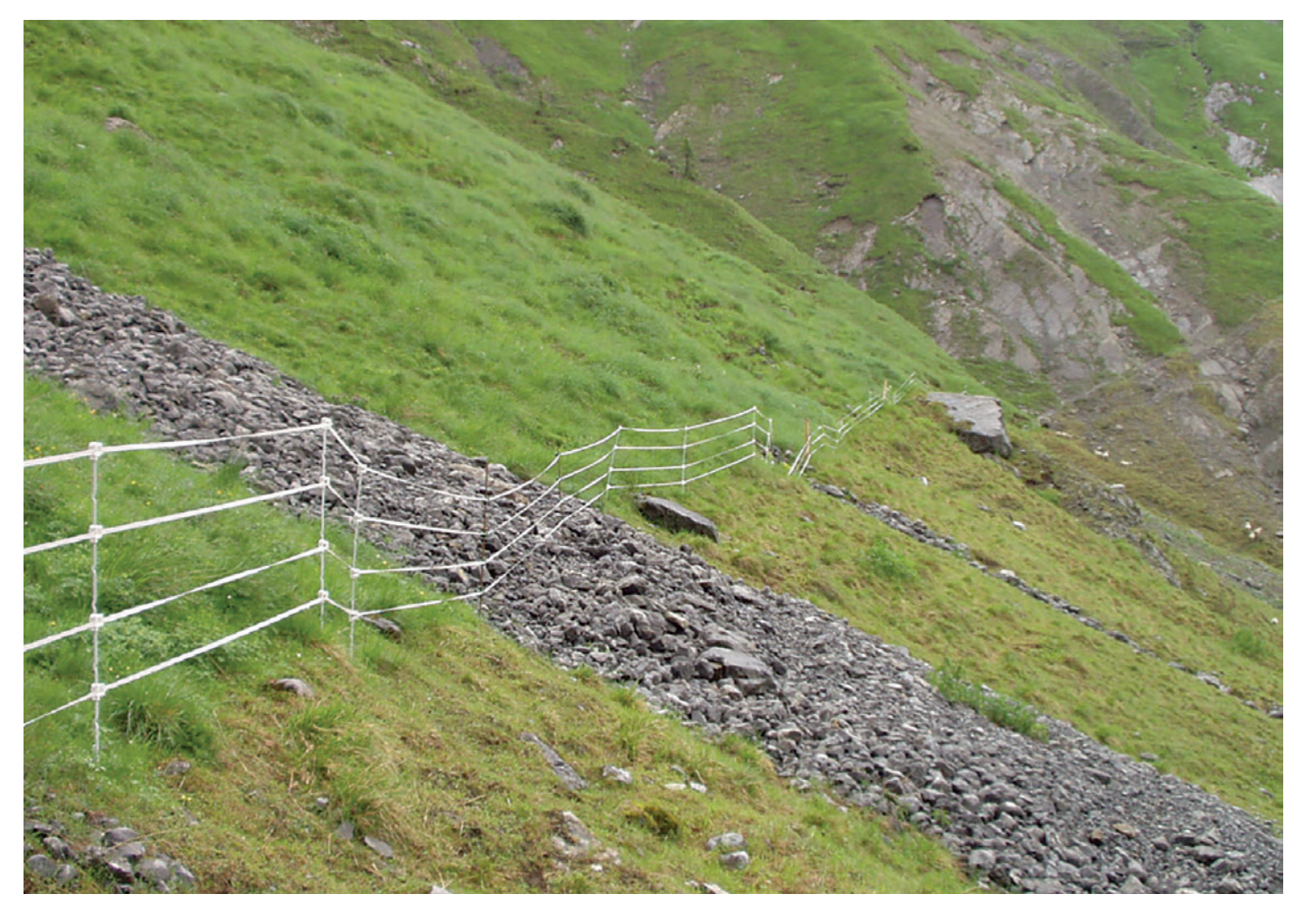
Fig. 6. Horizontal electric fences to ensure better use of forage potential, Oberarni Wolfenschiessen alpine farm, Switzerland, 2004.

It is generally recommended to begin adapting the alpine farming system in a first step to prescribed pasturing: systematic management of pastures in smaller sections to maintain natural resources and to keep the animals closer together. The most important aspect of prescribed pasturing is to restrict the free grazing of sheep on pastures (Fig. 4). Electrically fenced and productive pastures at lower altitudes are needed during spring and autumn (Fig. 5) and large pasture sectors limited either naturally (e.g. by steep rocky slopes) and/ or by electric fences at higher altitudes in summer. Spatial limitation of pastures facilitates control of livestock, rapid detection of predation and homogeneous herd formation. Therefore, animals need to be checked regularly by shepherds. Furthermore, spatial limitation of pastures prevents sheep from grazing mainly the highest areas and thus ensures a better utilisation of the given forage potential as well as reducing erosion (Fig. 6). Prescribed pasturing also enables the implementation