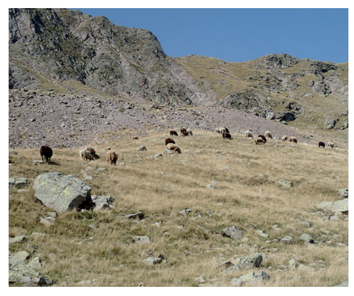
Fig. 3. Free grazing sheep at high altitudes without fences, Waldner Laugenalm alpine farm, South Tyrol, 2015.

low. On the other hand, this system makes it difficult to implement controlled pasturing and measures to protect flocks.