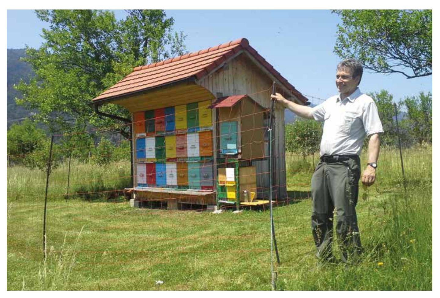
Beehives can be effectively protected by using electric nets or wired electric fences. It is crucial that pulses of strong electric current are present in the fence 24 hours a day all year long.

of fences has been shown to be crucial for effective damage prevention. Regular work with farmers who receive donated protection devices and elimination of mistakes is crucial for preventing of damage occurrence. Without proper maintenance of the fences, damages can continue to occur (Kavčič et al., 2013). As a result the belief that electric fences are not an efficient protection measure and that nothing short of lethal control can be done for damage prevention could easily spread among farmers.