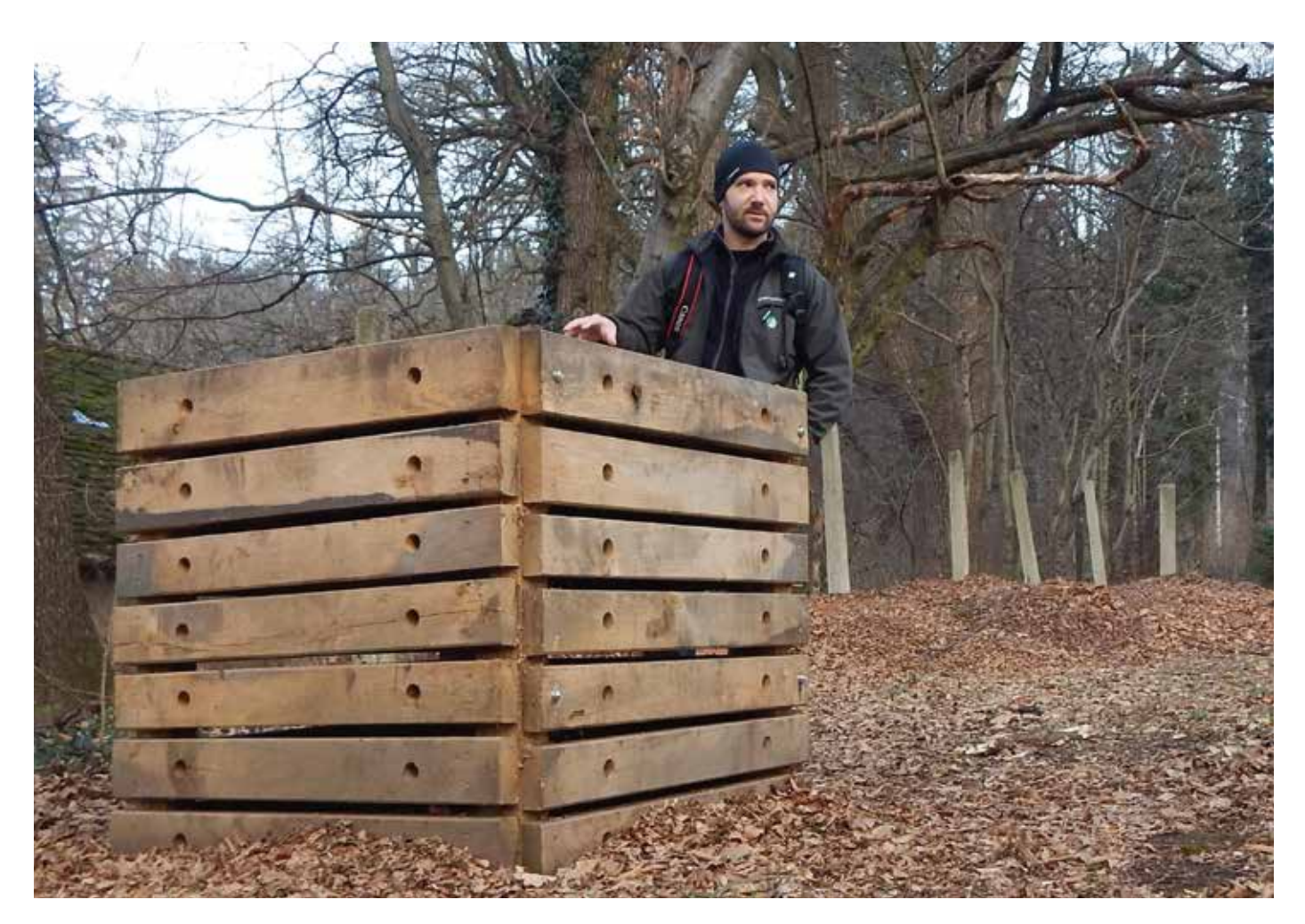
People in Slovenia often dispose of organic waste in compost bins in their backyards. Bear-proof compost bins prevent bears to gain access to this easily accessible food source in the vicinity of human settlements.

cate such sites during surveys with local inhabitants and during field-checking of GPS locations of collared bears near settlements. Within the LIFE DINALP BEAR project 22 bears will be collared. Locations of illegal rubbish dumps will be reported to the responsible inspection services and removed, with information given to the media to inform the general public.