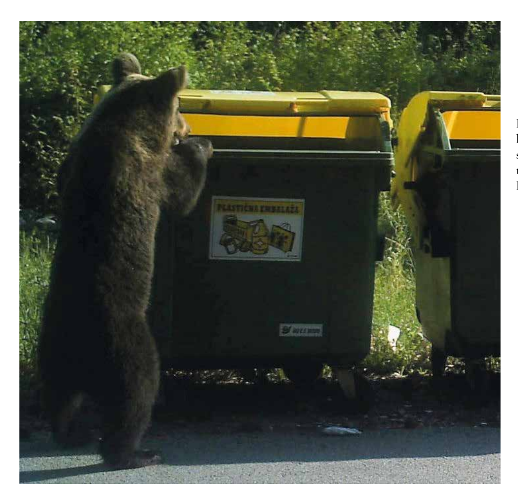
Food remains in regular garbage bins are easily accessible to bears, so they can attract bears into the vicinity of human settlements.

in the project area (Jerina et al., 2015). In all these cases, our goal is to prevent bears from approaching any kind of anthropogenic food sources. Two actions of the LIFE DINALP BEAR project directly address this issue and will be described in detail.