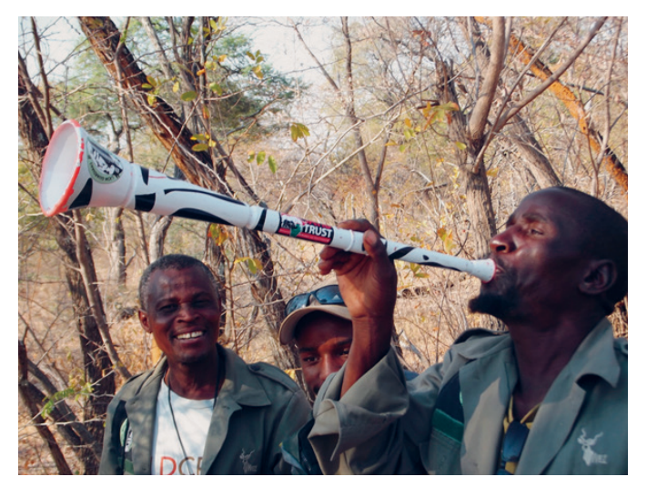
Fig. 3 Long Shields Community Guardians blowing a vuvuzela during a lion chase event.

We began our study in February 2019 using indepth face-to-face interviews consisting of closed and open-ended questions. Semi-structured interviews were preferred over structured techniques because they are flexible and allow the conversation to flow freely (Schensul et al., 1999). We attempted to interview men and women (self-reported heads of households) as equally as possible. Recognising the importance of ethics in conservation activities (Brittain et al., 2020), we fully explained the purpose of the study before commencing each interview, with all respondents giving verbal free and informed consent to voluntarily participate. All farmers were told they were allowed to stop the interview at any time if they did not feel like continuing. To help minimise response bias (e.g. social desirability), we did not provide monetary compensation