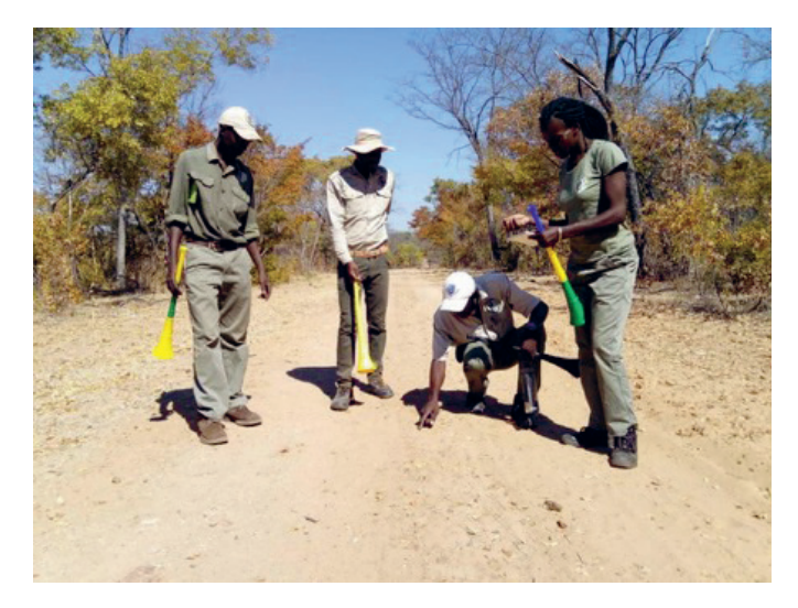
Community Guardians tracking lion spoor along the protected area-community interface.