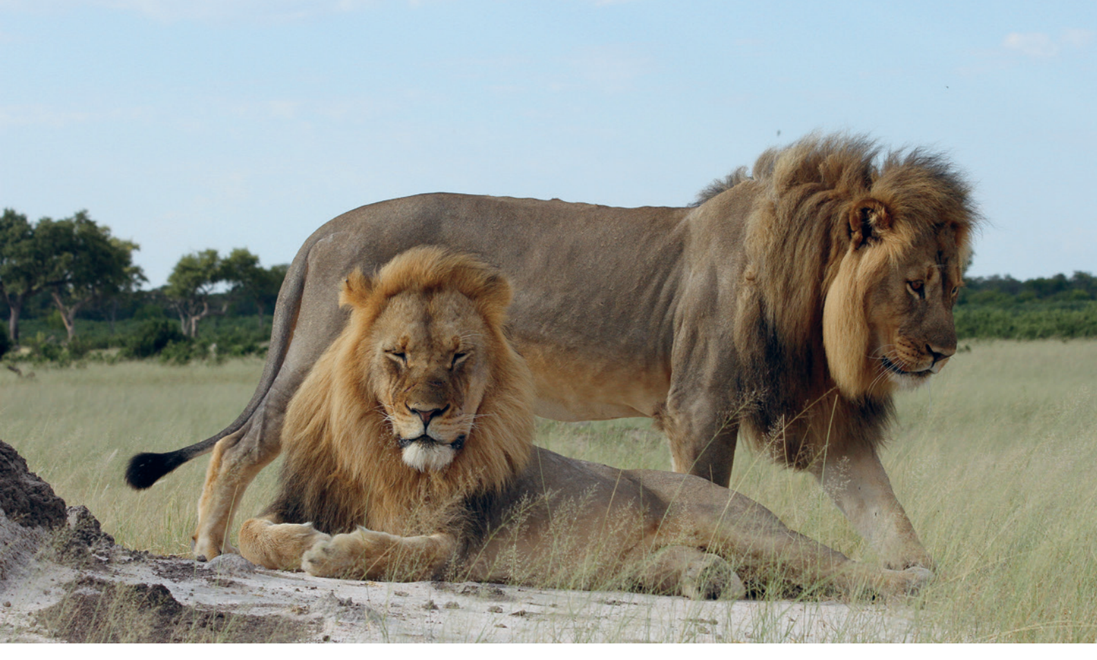
Lions in Hwange National Park, Zimbabwe.